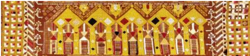
Figure 3: Darshan dwār (door way to the divine). Source: ( https://images.app.goo.gl/q2HSIvGA2CmAGxha9 ). Accessed Date: October 29, 2019.