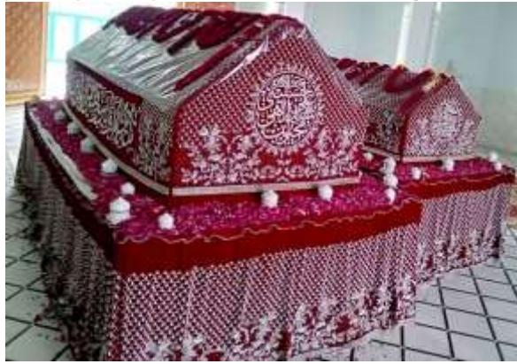
Figure 5: Tomb of Sayyid ‘Alī Hussainī ; Embroidered Cover of Cenotaph.

September 12, 2019