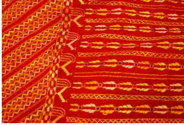
Figure 4: Gandum or Kanak dā Bāgh (Wheat)