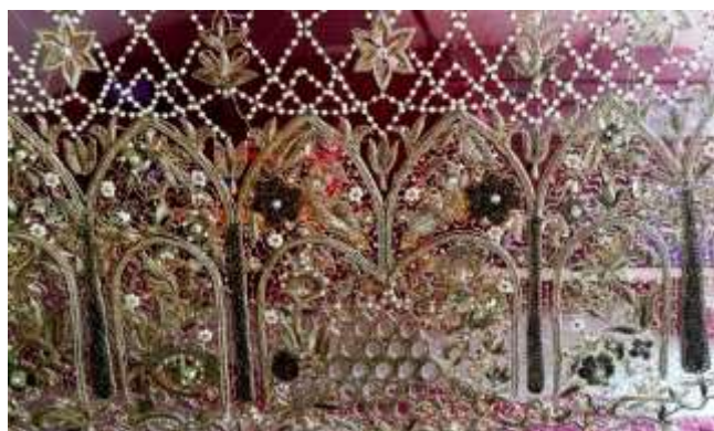
Figure I: Divine doorway pattern in Zardozi . August 25, 2019

Darshan dwār (door way to the divine) phulkārī is a religious token of gratitude presented on shrines and tombs to show the love towards their religion. This phulkārī is hanged on a visible place where the people come for seeing ( Darshan ) of their religious divinity. 13 Such phulkārī shawls are also presented on Gurdwārās as a token of thankfulness on getting a wish fulfilled. The shawl has pattern like kashmīrī shawl and has embroidery of gates with figures inside them which shows religious devotion. The name of the shawl depicts the purpose. It means that gate from where the God is seen. On the doorways of Shrine of Bahāuddīn Zakariyā , same pattern is placed on the bridal dress ( Ghāgra ) in Zardozi embroidery which symbolizes the link of human with divinity. The Sufis believe that the Murshid shows the path towards God. In the same way we can see the Sufism enveloped in the embroidery of Multan which suggests that Sufism has not only affected the lives of people but also has affected the craft especially thread craft.