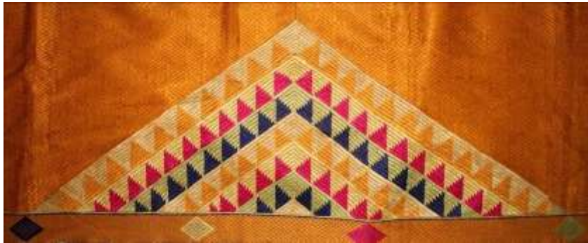
Figure 6: Phulkārī; Ghunghat bāgh

To represent unity in multiplicity the triangular shape of the mountain is the best example. Because base of the triangle is the multiple and so many multiple lines unite in one point. 21 In Ghunghat bāgh phulkārī triangular shape is made like a mountain which symbolically related to the unity in multiplicity. Ghunghat is veil used by women to cover them. It is a three cornered shawl which is used by the bride to cover her face. This shawl is also used to cover one’s self from elderly as a sign of respect. The bāgh is done on the side which covers the face. In east Punjab Sarpallū is used which is alternative to Ghunghat bāgh . Sarpallū as well as bāgh have red background on which embroidery is done with golden yellow or multicolored thread. 22