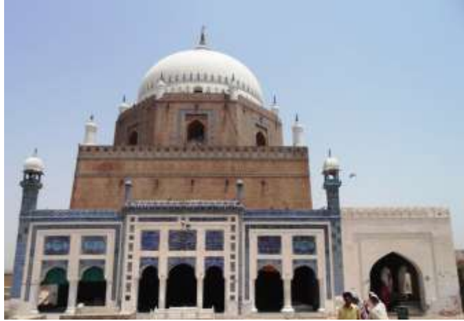
Figure 2: Bahauddin Dhakariya Shrine (door way to the divine). Photograph by Author: August, 20 2019.