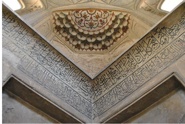
Figure: 5 Inna Fatahna Laka Fathan Mubeenan (O Muhammad] we have laid open before thee a manifest victory).

inscription on Dāī' Angā Mausoleum frieze on rectangular low neck dome room, frieze is in curve it is not flat and it deals with great deal of mastery in controlling the inscription with rounded background which makes it easy to read from ground.