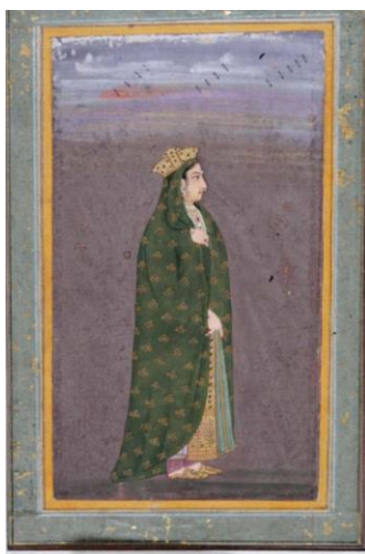
Figure .1. A Mughal Lady, 1750.courtesy by Lahore Museum Accession: B-82

Akbar was first to settle his reign in prominence in south-Asia suggested new term for burqa/veil called chitragupita in Sanskrit language (see figure:1 ). In the above painting present a royal lady is put green color long and slack burka, decorated with embroidery of gold, it covered the whole area of the princess body. During Jahangir reign similar practice done with female royal most of women wearing thick material and fully covered.