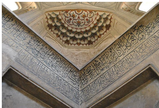
Figure: 2. Mausoleum Dāī' Angā Gulabi Bagh, Inner view Curved base of calligraphy easy view from ground.

near Shalimar Bāgh. This gateway was built by Shahzadī Sultan's husband. Tile work and ornaments at Dāī' Angā mausoleum is employed with astonishing finish and patterns. There are similar patterns repeated and done on female clothing in which Lahore museum miniature fig: 1 is evidence. Numerous railway structures surrounds garden area of Dāī' Angā . The squat